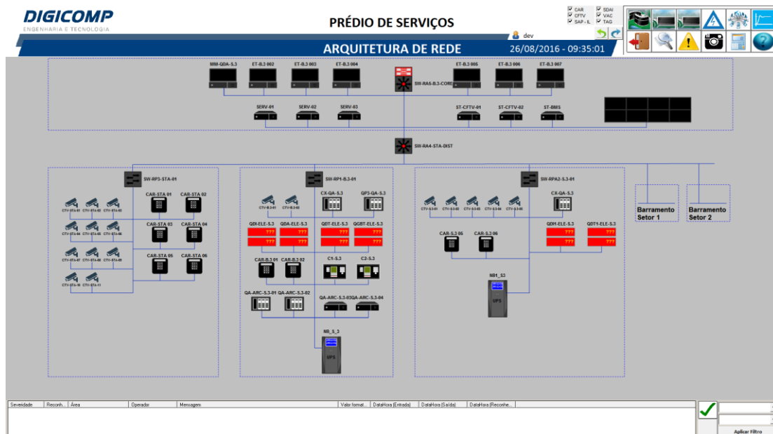
Figure 2. System’s architecture

The utilities complex’s infrastructure was built between March 2014 and October 2015. Its automation system’s architecture comprises one E3 Server, one OPC Server, and ten Viewers Control (12 software copies altogether). To establish communication with the 16 PLCs in the system, six different I/O drivers were employed: Modicon Modbus Master, Elipse Send Mail, BACnet, Elipse DDE Client, SNMP Manager, e Level 2.