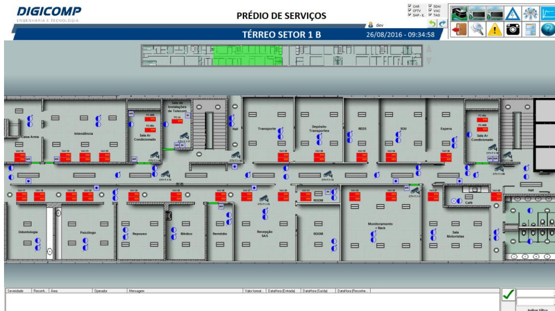
Figure 4. Lighting, AC, fan coils, entrance doors, security cameras, and smoke detectors are controlled by Elipse E3; in the figure above, the plant for the building’s ground floor, sector 1B

The same logic applies to fire detectors and security cameras. If the software detects smoke in the building, or if any cameras stop generating security footage, its respective icon will blink to indicate the incident, and additional information pertaining it will also be displayed on the lower half of the screen.