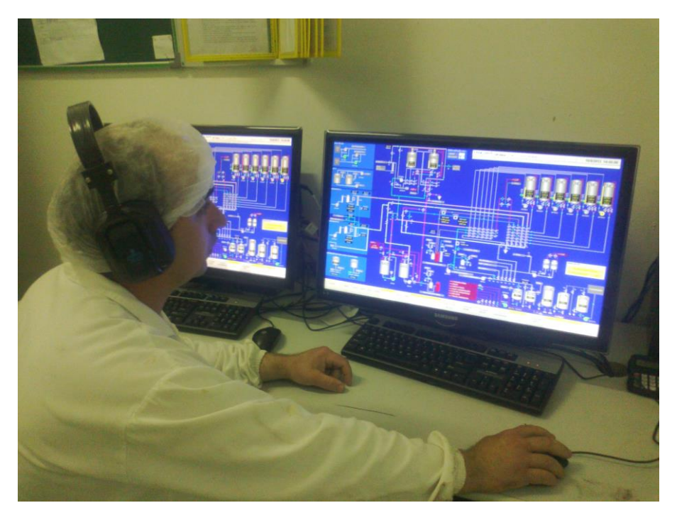
Figure 4. Operator in the command room

Check below some of the main benefits when using the software: