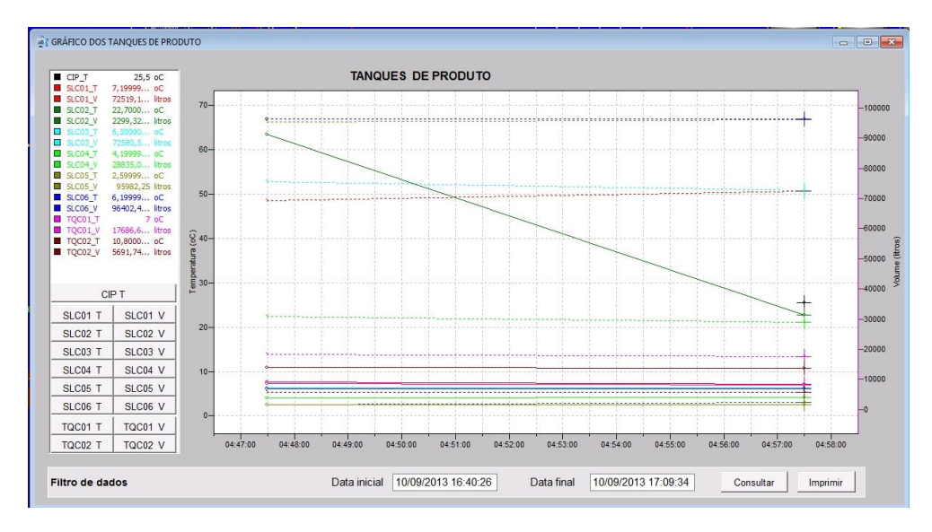
Figure 3. Chart of product tanks

E3 also provides reports and charts, with the possibility of exporting them to an Excel spreadsheet. Thus, the administration can prove the quality of its procedures to regulation agencies, as well as analyze the quality of the performed tasks and then define strategies.